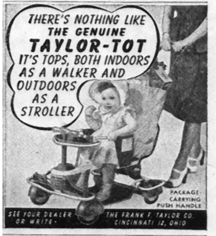
Ad from August 1949, Baby Talk magazine